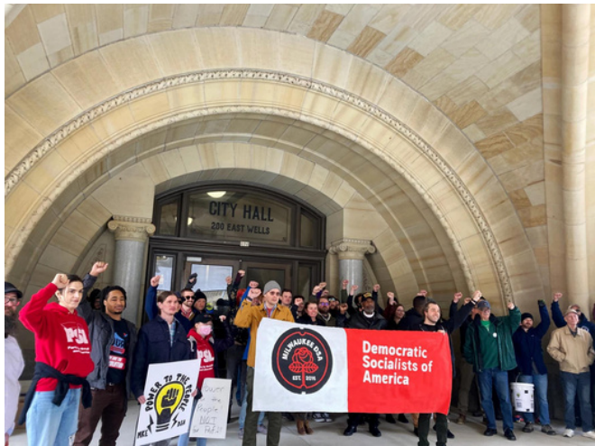
Power to the People rally outside of City Hall in Milwaukee.

https://www.wuwm.com/2023-05-02/milwaukee-campaign-to-replace-we-energies-with-municipal-utility-grows