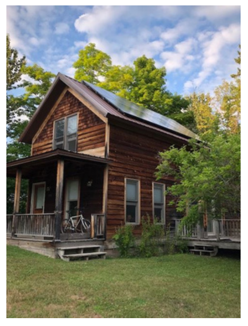
Image: a cabin with solar panels on the roof.

The MGE and Alliant proposals would hurt working Wisconsinites by making going solar more expensive and payback timelines unpredictable. Learn how you can help protect solar in Wisconsin at <u>www.renewwisconsin.org</u>.