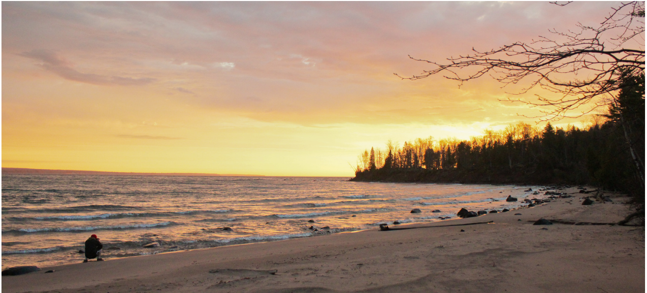
Image: sandy beach on a lakeside at sunset.

There is a place where the sidewalk ends And before the street begins, And there the grass grows soft and white, And there the sun burns crimson bright, And there the moon-bird rests from his flight To cool in the peppermint wind.