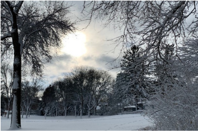
PARK ON WEST SIDE OF MADISON