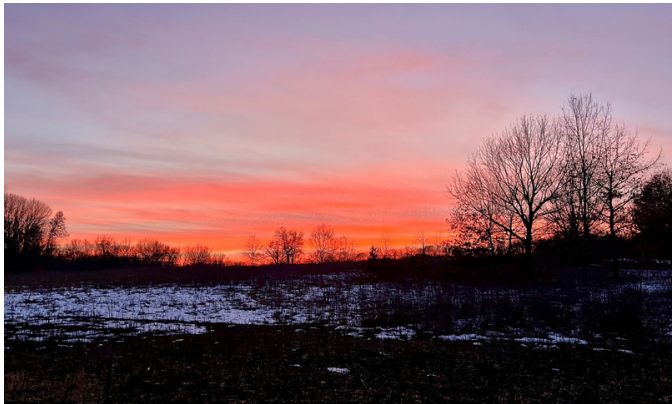
WINTER SUNSET