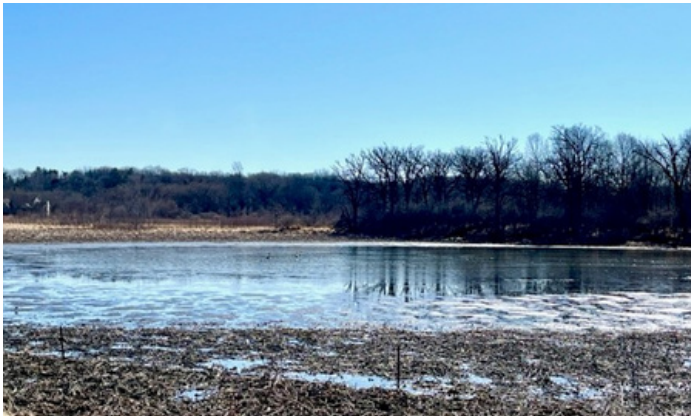
WETLAND ALONG THE MILITARY RIDGE STATE TRAIL