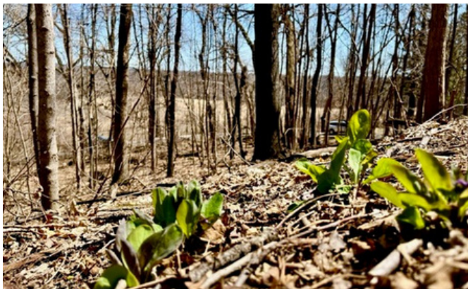
BLUEBELLS EMERGING IN THE WOODS