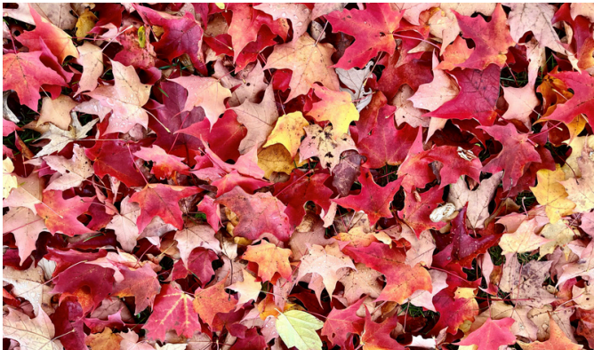
IMAGE: FALL LEAVES