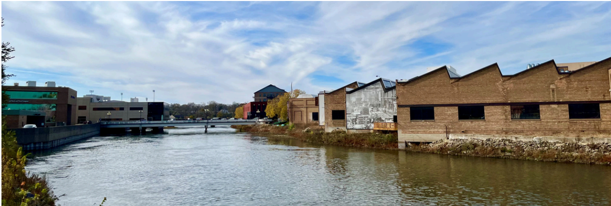
Image: Rock River in downtown Beloit

Mark your calendars for the WCT Fall Meeting on Friday, October 25! We will convene at Nature at the Confluence in South Beloit to share with each other, form a strategy for the year ahead, and hear about clean air initiatives in southern Wisconsin. Travel support is available. A detailed agenda will be shared closer to the meeting date.