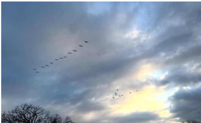
IMAGE: CRANES MIGRATING IN THE FALL