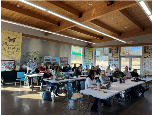
Image: group gathering in the main indoor space

Our fall meeting took place at Nature at the Confluence in South Beloit, IL. Illinois?! Yes, that's right, we met in Illinois. (To be fair, you could see Wisconsin out the window.)