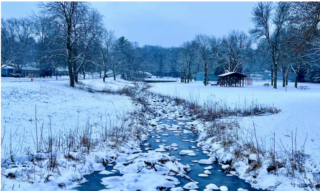
IMAGE: ICY CREEK IN A SNOWY PARK