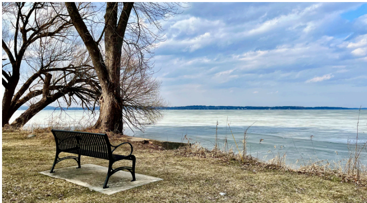
IMAGE: BENCH OVERLOOKING LAKE MENDOTA