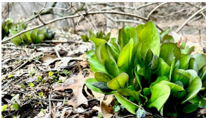
IMAGE: SPRING EPHEMERALS EMERGING